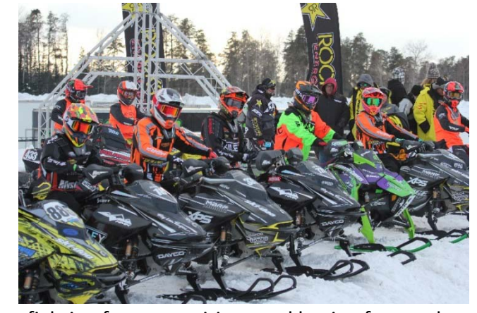
before our next event later this month so he can be back out fighting for top positions and having fun on the track.