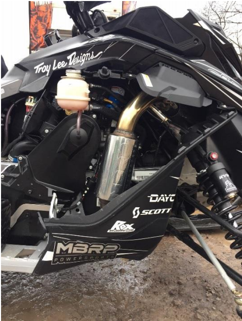
New MBRP race can

Back on board this year is MBRP, they have worked with us to develop an all new race can to compliment the exhaust system on the new sled, check them out if you haven't got yours yet.